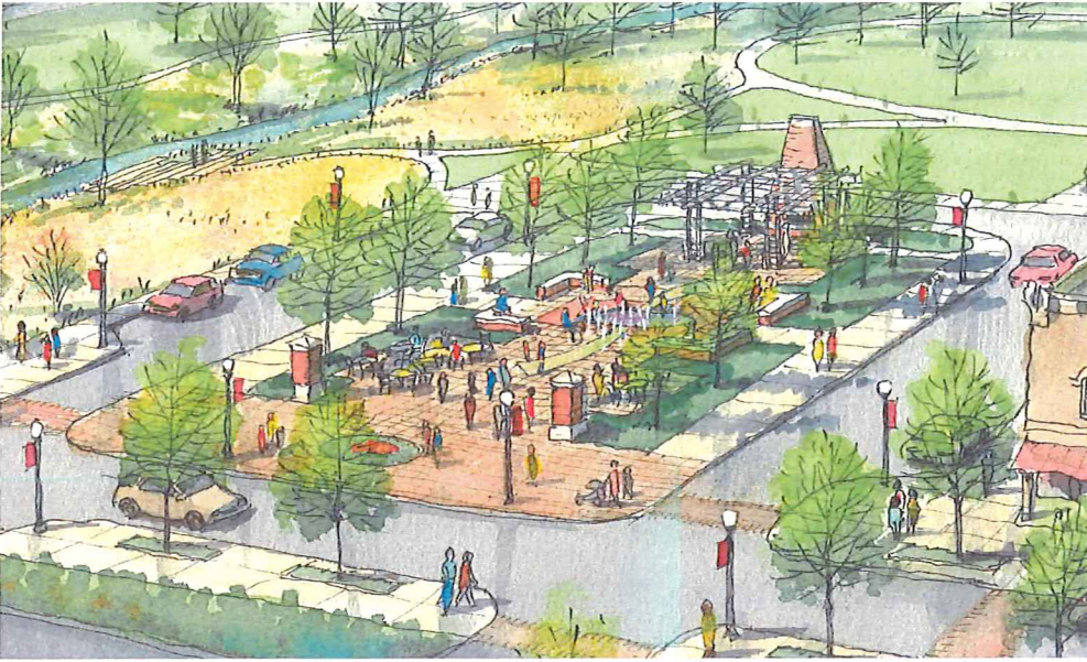
Black Fork Commons Plaza Enhancement Sketch