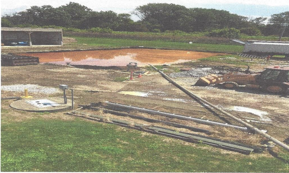
2019 HAZ-MAT incident at Waste Water Treatment Plant

In 2019 Richland County 911 started the process of upgrading the 911 radio equipment. The current system is obsolete. The County hired an outside firm to evaluate the cost effectiveness and radio coverage for 911. After the study was completed, the TAC (Technical Advisory Committee) for 911 suggested that a switch to the MARCS (Multi-Agency Radio Communications System) was needed. The building of an independent County system would cost $5,000,000 to $8,000,000.